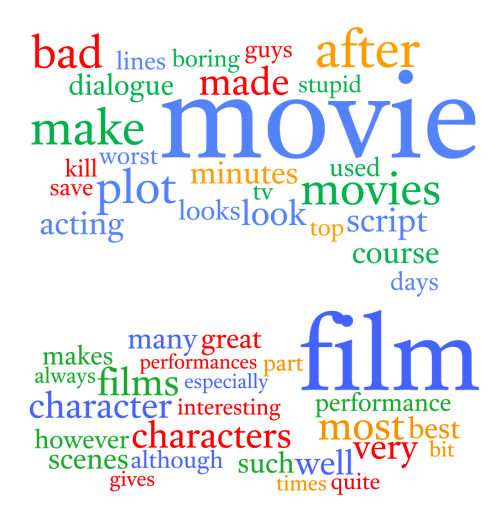
Figure 2: Fold all movie / film topics.

The first rule pulls uninteresting procedural words (e.g., "Mr. Chairman, I want to thank the gentlewoman for yielding...") into their own Topic 0. The other rules aim to discover interesting political topics associated with Rep on taxes and Dem on workers . As intended, Topic 0 pulls in other procedural words ({gentleman, thank, colleague}), improving the quality of the other topics. The special Rep taxes topics uncover