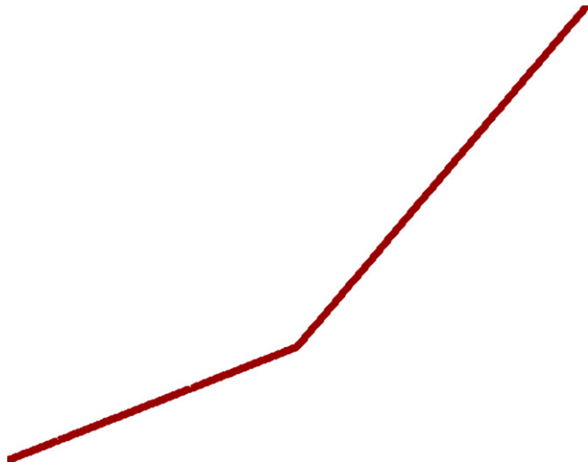
Fig. 1. A piecewise linear example of \theta .

This allows us to model nonsmooth L_1 approximation problems. Another special case results from the choice of \sigma = 0 , whereby