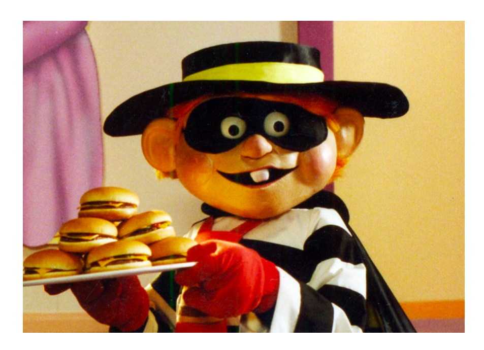
No one has been able to capture the Word Thief in a photo. This picture is of the Hamburglar. He steals hamburgers, or at least used to, before he was tried and convicted.

The Word Thief is at it again! This time, the Word Thief has gone through the ancient texts of operating systems and removed some key words, thus potentially confusing many generations of students! What a tricky one that Word Thief is.