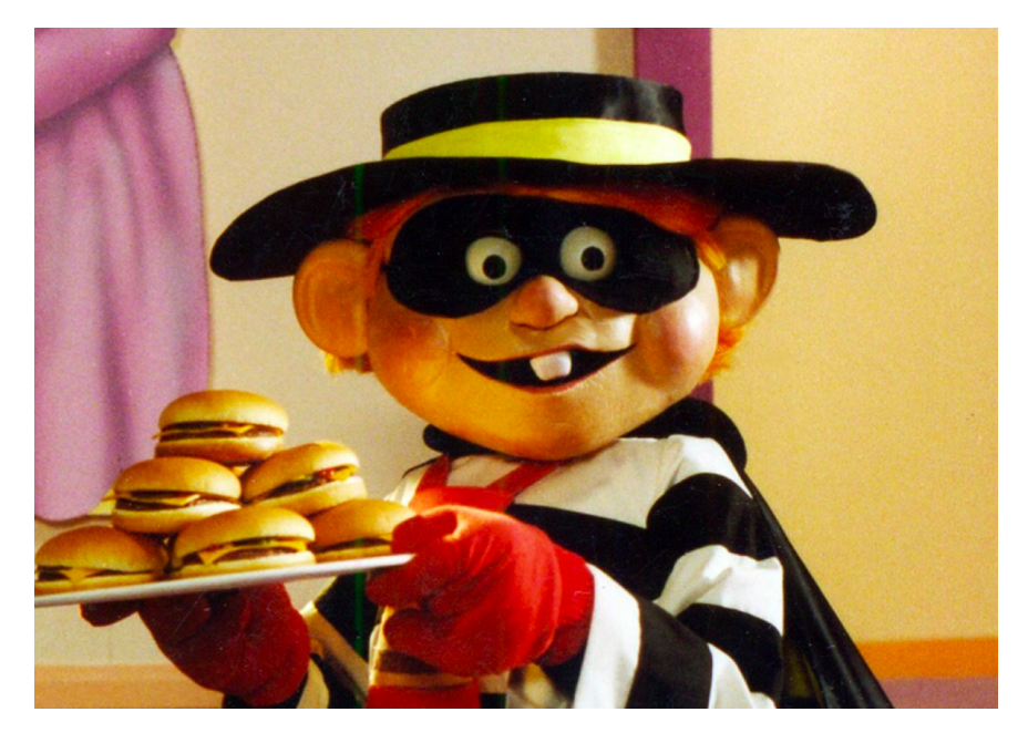
No one has been able to capture the Word Thief in a photo. This picture is of the Hamburglar. He steals hamburgers, or at least used to, before he was tried and convicted.

The Word Thief is at it again! This time, the Word Thief has gone through the ancient texts of operating systems and removed some key words, thus potentially confusing many generations of students! What a tricky one that Word Thief is.