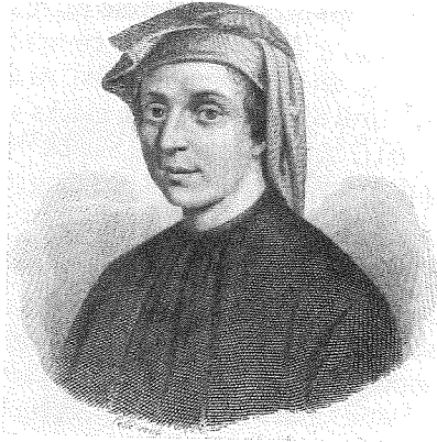
Leonardo of Pisa (Fibonacci) 1170–1250

But what is the precise value of F_{100} , or of F_{200} ? Fibonacci himself would surely have wanted to know such things. To answer, we need an algorithm for computing the n th Fibonacci number.