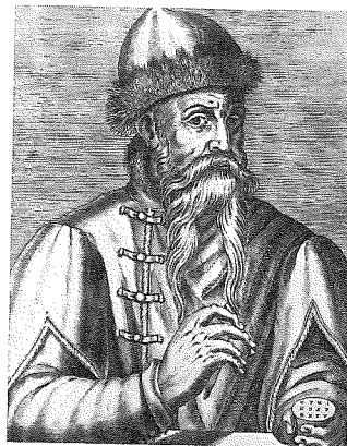
Johann Gutenberg 1398–1468

Two ideas changed the world. In 1448 in the German city of Mainz a goldsmith named Johann Gutenberg discovered a way to print books by putting together movable metallic pieces. Literacy spread, the Dark Ages ended, the human intellect was liberated, science and technology triumphed, the Industrial Revolution happened. Many historians say we owe all this to typography. Imagine a world in which only an elite could read these lines! But others insist that the key development was not typography, but algorithms .