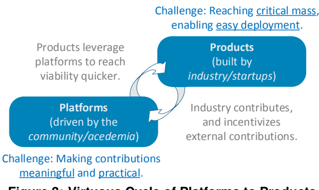
Figure 3: Virtuous Cycle of Platforms to Products

etary. Hence there are fewer back-end OSH modules. There are even fewer fabrication- and packaging-related OSH efforts, although BaseJump (bjump.org) is an example from academia.