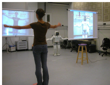
Figure 1. Participant with ASIMO.

conflict in small groups show that members of co-operative groups approach their group members more positively than members of competitive groups do [2,4]. Moreover, co-operative situations are friendly, intimate, and involving, whereas competitive ones tend to feel unfriendly, nonintimate, and uninvolved [4]. Based on these results, we hypothesized that people who interact with a robot in a co-operative task will perceive the robot more positively and feel more positively than people who interact with the robot in a competitive task.