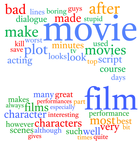
Figure 2: Fold-all movie / film topics.

The first rule pulls uninteresting procedural words (e.g., “Mr. Chairman, I want to thank the gentlewoman for yielding...”) into their own Topic 0. The other rules aim to discover interesting political topics associated with Rep on taxes and Dem on workers . As intended, Topic 0 pulls in other procedural words ( \{\text{gentleman, thank, colleague}\} ), improving the quality of the other topics. The special Rep taxes topics uncover