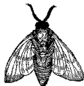
Figure 2: A sample black and white graphic (.eps format) that has been resized with the epsfig command.

Other common constructs that may occur in your article are the forms for logical constructs like theorems, axioms, corollaries and proofs. There are two forms, one produced by