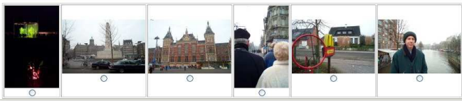
Figure 2: Screen shot of our user study.

Please choose the one image below that you think best represents the set above and press "Select Image"