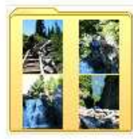
Figure 1: Example of a folder containing images when in Thumbnail view in the Windows Operating System.

Average Histogram: The image in the set whose histogram